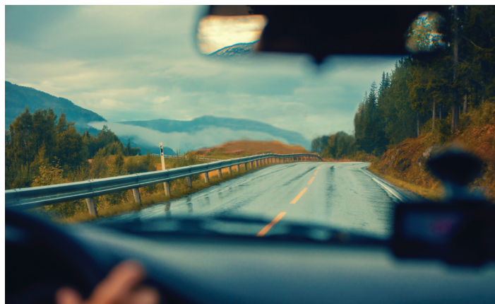
Figure 1 Normal vision