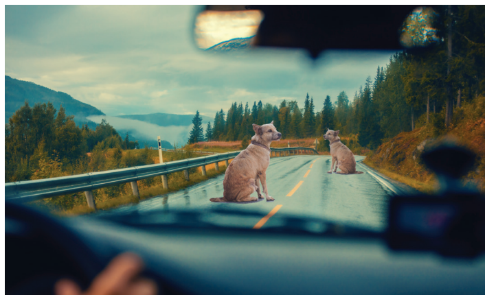
Figure 2 This simulation illustrates hallucinatory images characteristic of CBS. Individuals may see trees, animals or people that do not exist. Reports vary widely including those of seeing abstract hallucinations such as solid colors or patterns filling the field of vision.