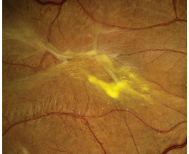
Figure 2 Epiretinal Membrane