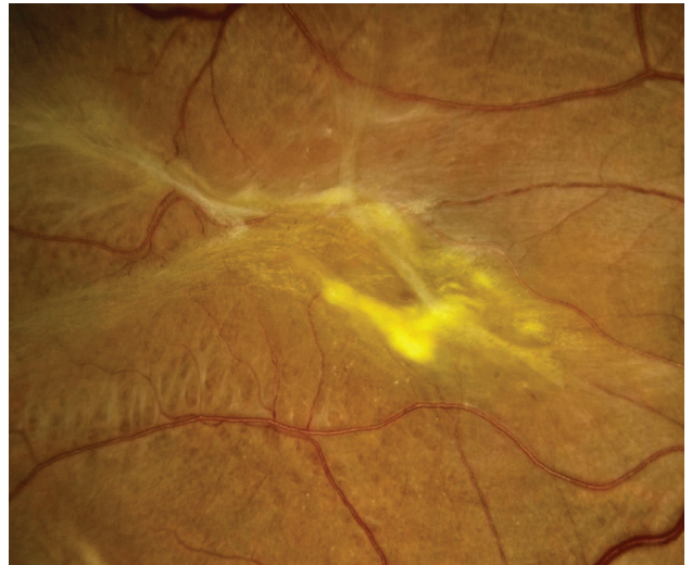
Figure 2 Epiretinal Membrane