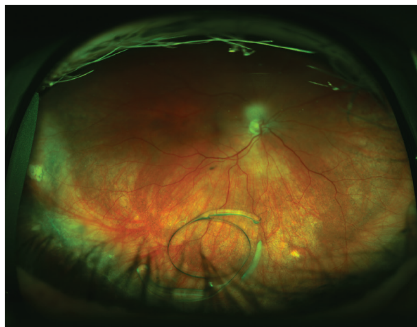
Figure 1 Dislocated intraocular lens in vitreous cavity.

Causes: During most cataract surgery procedures, the IOL is placed inside the capsular bag, a sack-like structure in the eye that previously contained the cloudy lens. In some situations, this extremely thin capsular bag or the fibers that hold it in place rupture and the IOL support is compromised.