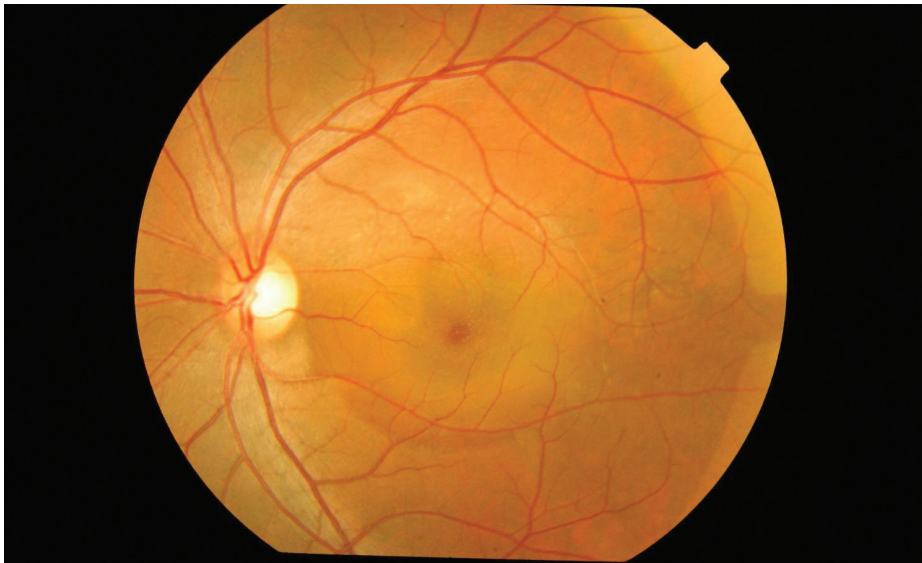
Color fundus photograph of left eye of a 33-year-old man with bilateral CSC. Mallika Goyal, MD, Apollo Health City, India. Central serous chorioretinopathy. Retina Image Bank 2012; Image 2117. ©American Society of Retina Specialists.

CSC most often occurs in young and middle-aged adults. For unknown reasons, men develop this condition more commonly than women. Vision loss is usually temporary but sometimes can become chronic or recur.